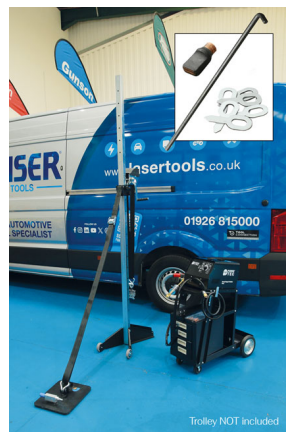
Trolley NOT Included