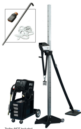
Trolley NOT Included